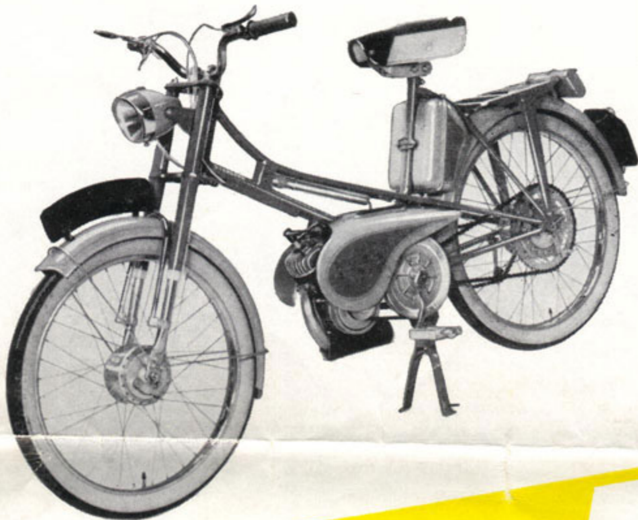
STANDARD MODEL 53 Gns. INC. P.T.

This model is supplied with Legshields at no extra cost