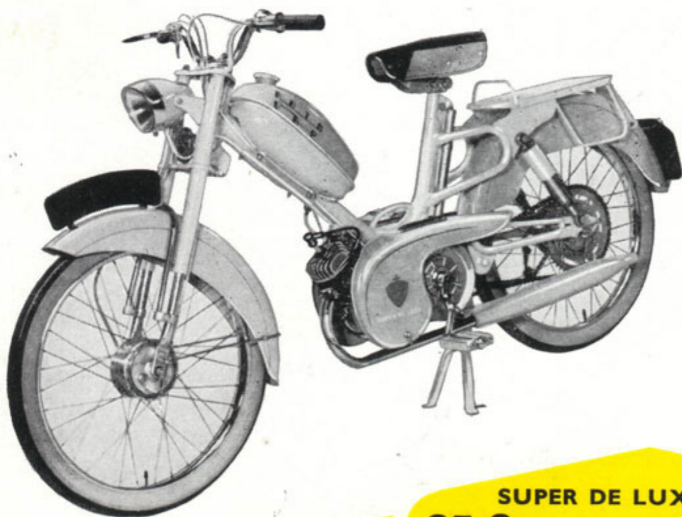
SUPER DE LUXE MODEL 65 Gns. INC. P.T. also available as Dual Seat Version 66 Gns.